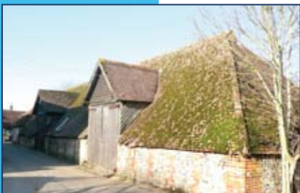
The Grade II Listed Sussex Barn