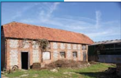
The 2 Storey Victorian Barn